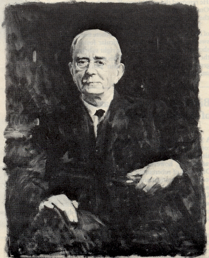
Sir Charles Scott Sherrington by R G Eves.